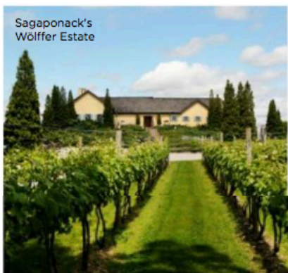
Sagaponack's Wölffer Estate

FOR MORE ON THE HAMPTONS, VISIT DUJOUR.COM/CITIES