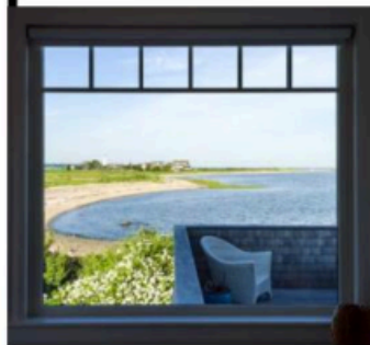
A shoreline view from the newly constructed cottage at the Hepburn estate

The Connecticut hideaway built in 1939 by legendary actress Katharine Hepburn is back on the market following a faithful restoration by Sciame Development , an affiliate of Sciame Construction (the muscle behind some of New York City's boldest projects, like The Shed, Hudson Yards' 17,000-square-foot arts space in a retractable glass shell). When renovating classic homes, the family-owned firm prides itself on its meticulous attention to detail. But make no mistake: At 8,300 square feet, the six-bedroom Hepburn estate—on the Long Island Sound in the tony hamlet of Old Saybrook—is anything but small-scale. Following the On Golden Pond star's 2003 death, the Sciames swooped in, intending to flip the windblown fixer-upper. But after a makeover that retained many of the house's original details, like exposed brick and pine-paneled fireplaces, CEO Frank Sciame Jr.'s wife insisted they keep it; the family vacationed there for years. (Along with the main house, a 3,800-square-foot cottage that the Sciames added to the property is also for sale.) The price is upon request—but with panoramic water views and the aptly named Golden Pond out back, the home, and its history, can be better described as priceless. sciamedevelopment.com